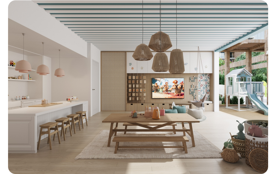
Kids' Play Area