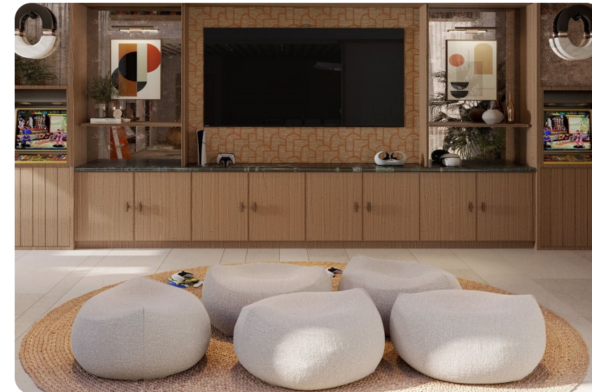
Teen's Club Lounge