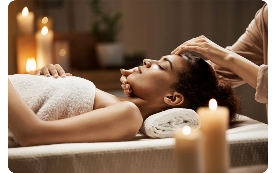
Spa & Wellness Centers